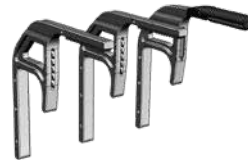
Extension set for use with vans