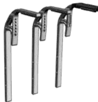
Set of XL extensions for wheel diameter from 32" to 39"