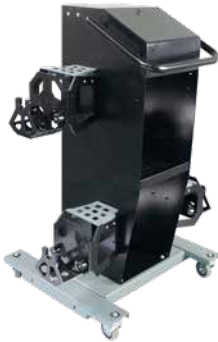
Clamp holder multi-purpose trolley and additional jaws