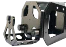
Clamp holder set for wall mounting with support for additional jaws